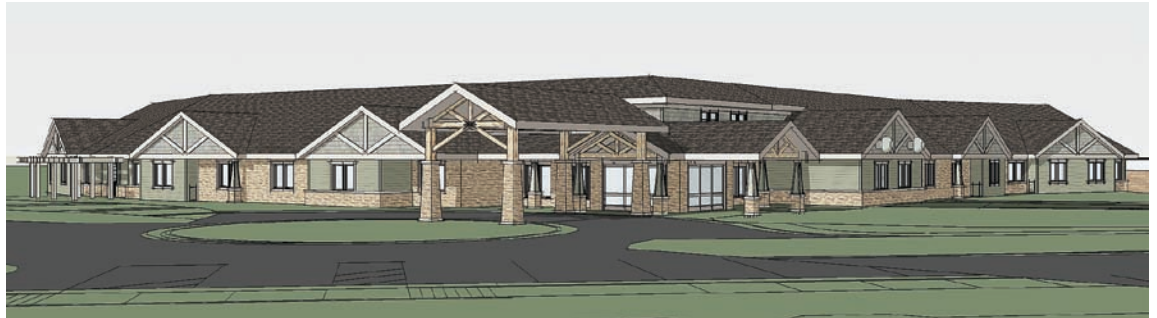
The new 23,000-square-foot assisted living facility for the Evangelical Lutheran Good Samaritan Society, located in Ottumwa, Iowa.